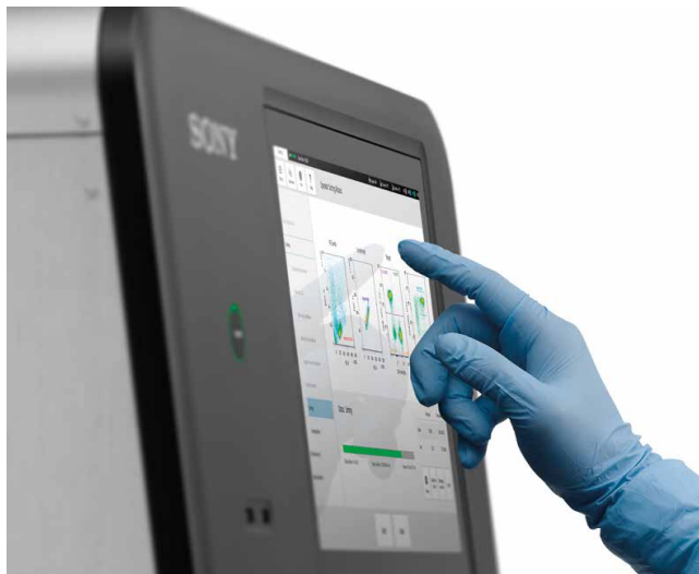
CGX10 Cell Isolation System

Innovative Microfluidics Based Cell Isolation Technology